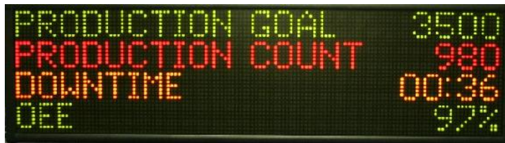
Production Marquee (Part # PM-0420-T)

DataVisor Marquees has built the Production Marquee Series that combines a visual display with ethernet communications, digital I/O, and web server technology integrated into one self contained package. With no software to install and the data source formulas programmed into the marquee, all you have to do is select the functionality of the application from drop down menus. Setup and monitoring of this real time production data is as simple as opening a web browser and entering the IP address of the marquee display. Imagine real time plant floor production data monitored and collected anywhere within your facility. Just supply two inputs, enter your target counter value and cycle time and the Simple OEE calculation is displayed, monitored, and collected by simply choosing OEE as the data source. Additionally, you can select your Goal, Break Schedule, and other Production Data Sources that are important to view and monitor from your production process.