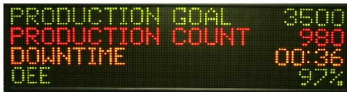
Production Marquee (Part # PM-0420-T)

DataVisor Marquees invites you to take the time to read this guide to understand Simple OEE and how to implement this tool in your facility. After reading our "Complete Guide to Simple OEE" you will have a better understanding of Simple OEE and how we can help you visualize, monitor, and collect OEE data in your plant with the Production Marquee.